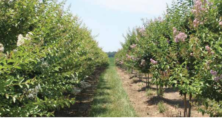
To Our Returning Friends and Prospective Customers,

We would like to take this opportunity to wish each of you a happy and healthy new year. We would also like to thank our loyal customers for your continued support. We are very aware that in this technological age of Internet surfing that you have many options of where you choose to buy your nursery stock. To our prospective customers we hope that we have the opportunity to gain your business by cordially inviting you to visit our nursery whenever possible, whether by land or air. It continues to be our commitment that by visiting our nursery and meeting our friendly and professional staff that you would see that we take great pride in the following areas: