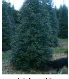
Nellie Stevens Holly