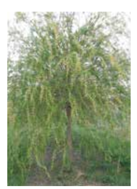
Quercus phellos (Willow Oak)

Long slender branches give this large tree a graceful appearance. The leaves are long and narrow.