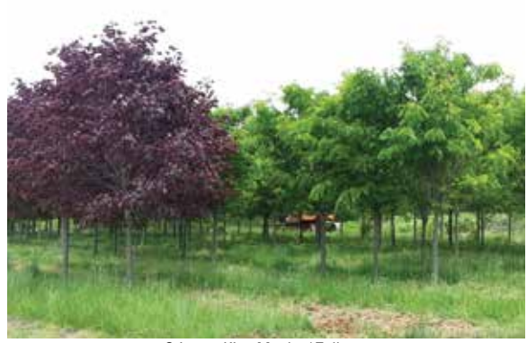
Crimson King Maples/ Zelkova