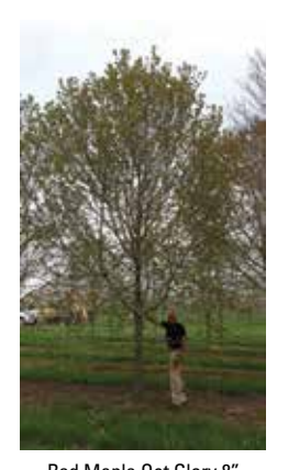
Red Maple Oct.Glory 8"

Red sunset is the most highly rated and reliable of the Red Maple cultivars. It is a vigorous growing tree with a strong and symmetrical branching pattern. The foliage is a very lustrous green in summer, changing to brilliant shades of red and orange-red in the fall.